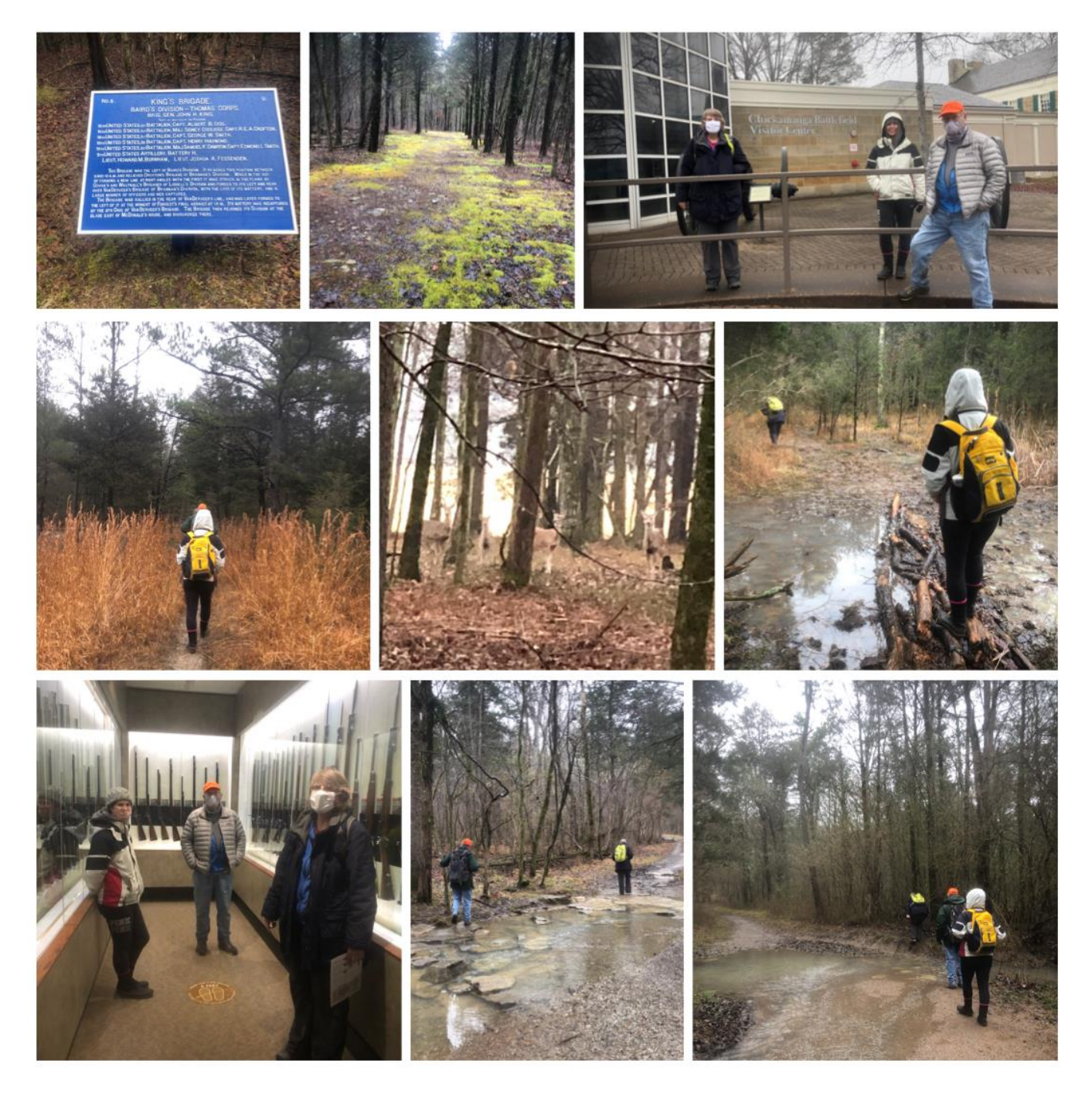
FEBRUARY 22, 2021 THUNDER ROCK LOOP